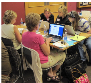
Group at work developing literacies for a Student Digital Media Activities workshop held in Paterno Library (PA).