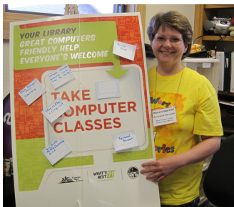
The Red Feather Lakes Library (CO) offers public computer classes.

WebJunction gathers helpful articles, handouts, worksheets, videos and presentations from library practitioners and topic experts like you. Use these resources to gain confidence with technology tools, innovate services to your patrons, and develop your personal leadership skills. We cover the full range of library practice, to help you in your career. Get started at webjunction.org/explore-topics .