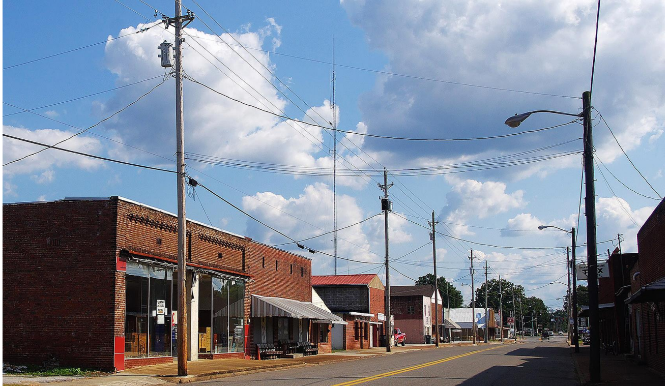
Town Creek Main Street