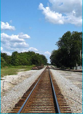
Town Creek RR tracks