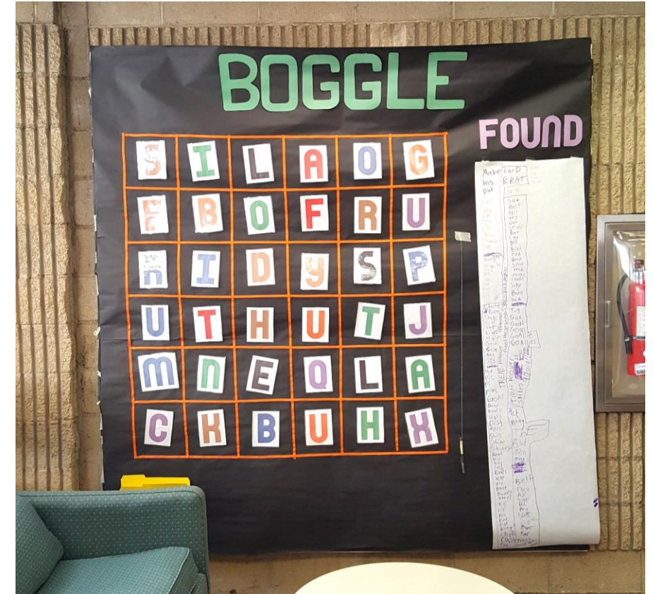
One of the first changes: A community Boggle Board.