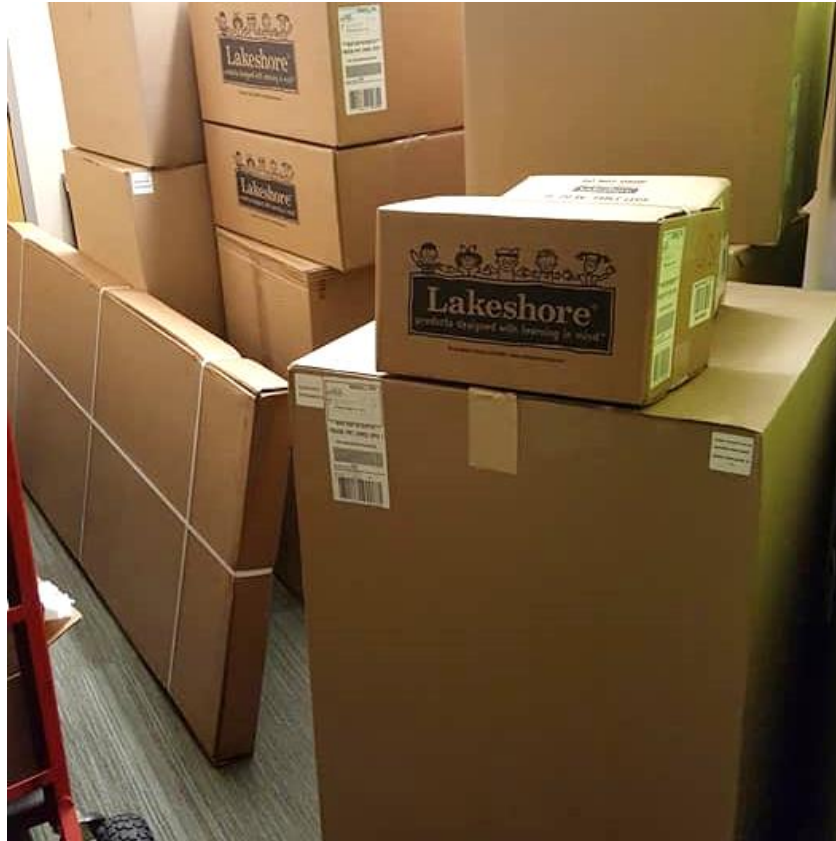
Active learning materials are received at the Punxsutawney Memorial Library.

To provide the community with safe, welcoming spaces which members can utilize to build better connections.