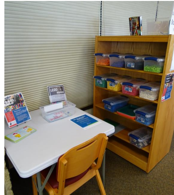
The "Makers Corner" full of Legos. Featured challenge: make your name out of Legos!