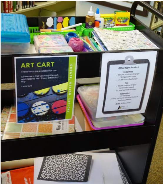
One of the library's two new "art carts" full of art supplies and activities.