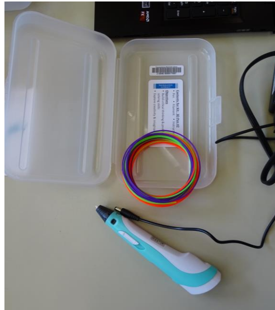
3D Pen ready for use in the new Smart Space.