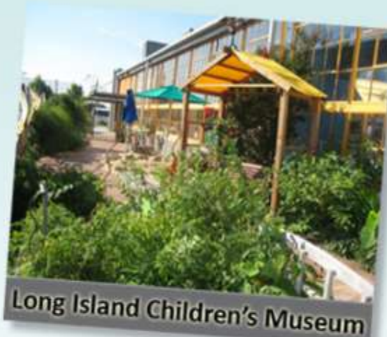
Long Island Children's Museum