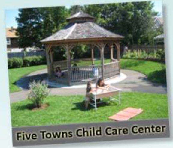
Five Towns Child Care Center