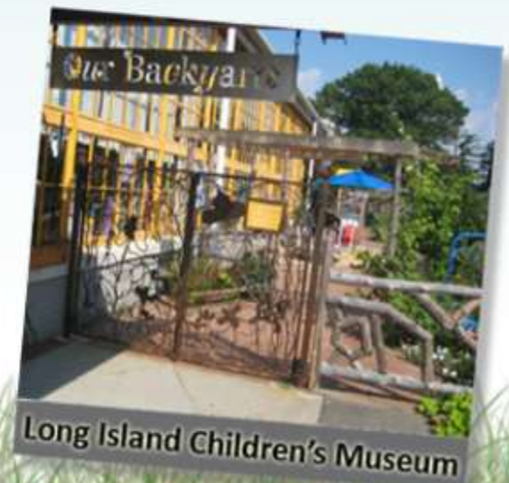
Long Island Children's Museum