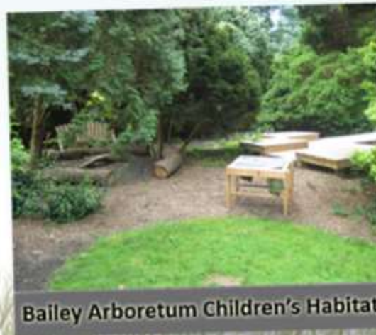
Bailey Arboretum Children's Habitat