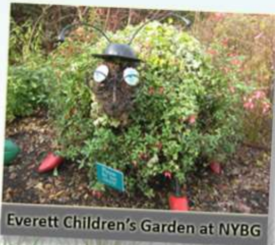
Everett Children's Garden at NYBG