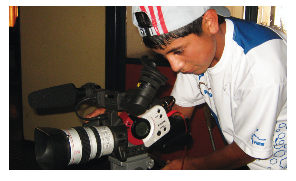
CITIZEN JOURNALISTS: Young citizen journalists are learning media skills so that they can produce and publish information relevant to youth in 10 towns and villages in Chile's Araucanía Region.

This library project is training 30 young citizen journalists to produce media relevant to youth in 10 towns and villages in Chile's Araucanía Region. Araucanía is a primarily agricultural region; poverty is widespread. The majority of people living in the region are ethnic Mapuche, and the library's project addresses the interests of Mapuche youth who do not have space to express their views. The project works through a network of 10 public libraries. In addition to providing practical journalism and digital technology skills, the library is developing an interactive web-portal where young citizen journalists can upload their work, debate topical issues and communicate with their peers. http://bit.ly/1w9t4SW