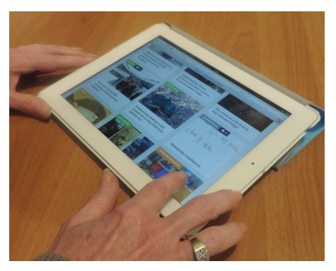
CREATIVE YOUTH: Young writers and artists can create and view text and images for GKR Magzin from desktop, laptop and tablet computers, and smart phones.