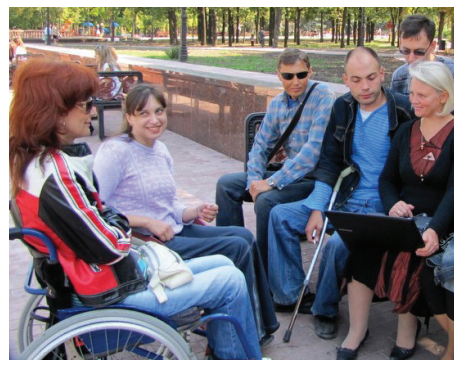
OUTDOOR CLASSES: The library trains people living with disability at their homes, in the library and in other places where they feel secure and comfortable.

communication training has improved the ability of 38 librarians to guide information searches for people with disability. The library has also created a database of library users who live with disability, detailing their situations and information needs. In 2013 the service won an EIFL Public Library Innovation Award for contribution to social inclusion in the community. http://bit.ly/1opqpAm