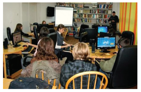
SAFE SPACE: The library's lively and attractive multi-media Youth Corner is a safe space for young commuters who have to wait long hours for buses to take them home from school