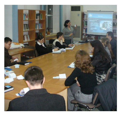
DATABASE TRAINING: Librarians at Moldova Public Law Library train civil servants to use the library's legal database.

and in October 2012 they launched the database. In addition to providing free access to the database, the library offers courses in using search engines to find legal information on the internet and strategies for searching the new database. The library also invites experts to give public lectures on legal issues. In 2013, the service won an EIFL Public Library Innovation award for contribution to open government. http://bit.ly/U6hQm8