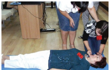
SAVING LIVES: People of all ages attend GH. Asachi County Library Iasi's First Aid Toolkit training.

ambulance staff volunteer to support the training, give lectures and help manage an online training course provided through the library's website. In 2012 the library won an EIFL Public Library Innovation Award for contribution to community health. http://bit.ly/1qaK6Qs