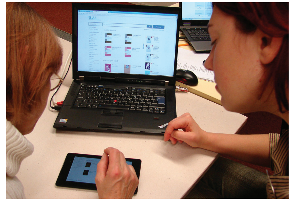
LITERATURE ONLINE: A librarían at Tallinn Central Library shows a service user how to Access the library's pioneering e-book lending service.

Tallinn Central Library developed an online lending service that gives Estonians across the world roundthe-clock access to modern Estonian literature in formats that are compatible with computers, tablets, smart phones and e-readers. In just two years, the library built up a collection of over 680 Estonian e-book titles for the service, which is known as ELLU. Over 2,700 registered library users in Estonia and living in the US, Europe, China and Taiwan have used the service, borrowing the books nearly 16,000 times. This pioneering service is making its mark: "Our e-book lending programme has led to discussion on the future of e-books and has highlighted the need for copyright law reform in Estonia," said Triinu Seppam, Director of Library Services. In 2014 the service won an EIFL Public Library Innovation Award for creative use of ICT in public libraries.