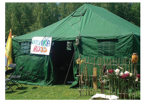
FARMER'S PARADISE: Pasvalys Marius Katiliskis Public Library takes ICT to agricultural markets and fares, and conducts ICT training in the 'Farmer's Paradise' tent.

publishing centre where librarians help farmers design marketing leaflets and business cards. In less than a year (2011/12), the library trained over 120 farmers, entrepreneurs and rural librarians to use ICT, worked with farmers to publish 600 leaflets and 200 product labels, and attracted 68 advertisements to the web-portal. http://bit.ly/1q3dH14