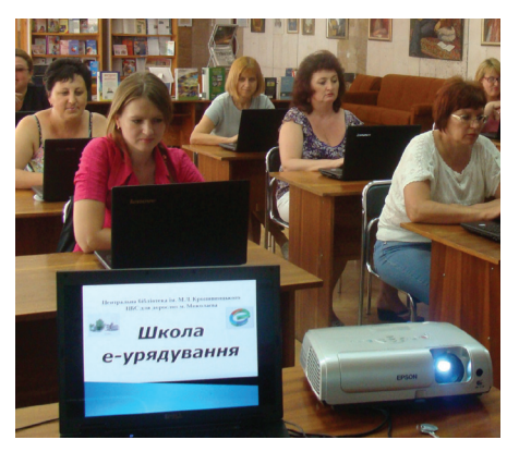
ONLINE INTERACTION: The Citizen Service Centres are encouraging citizens to use library computers to interact with government offficials online.

2,100 people used the Citizen Service Centres. The service encourages online interaction with government officials. Since the centres were launched, residents have asked the Mayor of Mykolayiv 124 questions online, and the Mayor has successfully resolved 32 problems raised. In 2013, the library won an EIFL Public Library Innovation Award for contribution to open government. http://bit.ly/10MuzFp