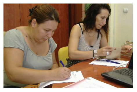
NEW JOBS: The library's training for job-seekers helped 39 people find jobs in Radovis and Konce municipalities, where unemployment is estimated to be over 30%.

integration from the ERSTE Foundation. In 2012, Radovis Municipality named the library as a strategic partner in providing training and information services for the unemployed. The library has also expanded its ICT training to include the elderly, vulnerable women and children and minority ethnic groups. http://bit.ly/1sFM5vY