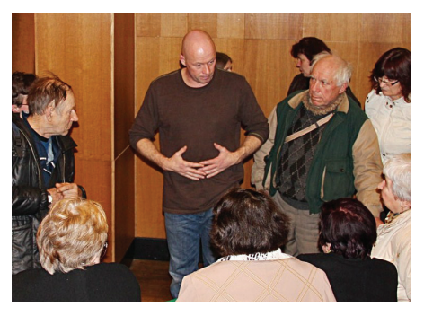
HEALTHY LIVING: Yoga classes were popular with the over 60s who flocked to Kaunas County Public Library's BiblioHealth courses.

free access to ICT, computer literacy and internet research training for the over 60s. An online BiblioHealth resource includes 82 useful links to health information, webportals, e-government health services, clinics, hospital websites and other websites promoting healthy lifestyles. http://bit.ly/1bMV9FX