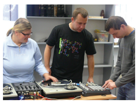
MAKING MUSIC: Young musicians try out their musical skills in Olsztyn Municipal Public Library's ICT MultiCentre.