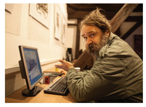
HOMELESS SHELTER: Zagreb City Libraries provides ICT training in Zagreb's biggest homeless shelter, Kosnica, where homeless people feel more comfortable.

homeless, where homeless people feel more comfortable. The library hosted a conference on homelessness to raise awareness about the issue, and has published a book about homelessness. The service inspired Zagreb's Law Faculty to establish a free legal clinic for the homeless, and two other homeless shelters are now also taking part. http://bit.ly/MA3uqG