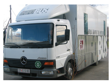
FARMING SUBSIDIES: Librarians at Regional Public and University Library 'Goce-Delcev' – Stip travel to villages in the library's INFOBUS and train farmers to use ICT to apply for grants and subsidies.

the government farm support agency, librarians organized 30 seminars attracting 357 participants; provided individual guidance for 145 farmers to apply for grants, and trained 42 farmers to use ICT. The library also developed the web-portal for farmers, with links to information about subsidies, support agencies and articles about farming methods. http://bit.ly/1tukSRk