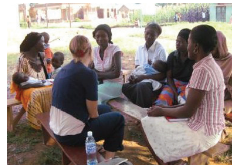
INFORMATION FLOWS: The library's health service helps improve communication between health workers and people living in remote rural villages.

workers and schoolchildren distribute in remote villages. Guided by health workers, the children also perform short plays to promote healthy lifestyles. As a result of the project, the library developed a partnership with the local non-governmental organization, A Little Bit of Hope, which has built pit latrines for 30 households in two villages, and is helping disseminate the library's messages about sanitation, nutrition and hygiene. http://bit.ly/1y2tWvt