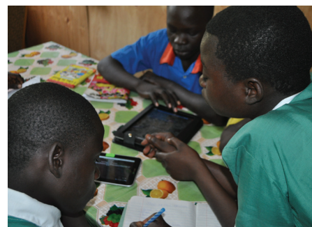
LEARNING FUN: Children use tablet computers at Busia Community Library to access educational content linked to the school curriculum and to play educational games.