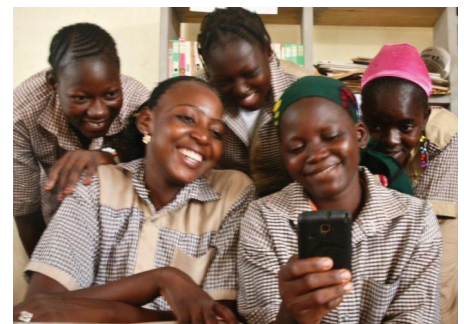
HEALTH CLUBS: Teenage girls in rural villages will learn to learn smart phones to access health information through the 'Girls Mobile Health Clubs' project.