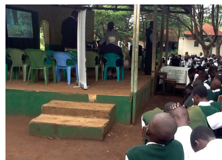
VIDEO CONFERENCE: Kisumu High School pupils take part in a multi-school video conference organized by the library. When large groups of children take part, schools use projectors to magnify images and speakers to amplify sound.