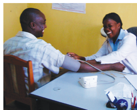
E-HEALTH CORNERS: Kenya National Library Service's e-health corners support local health service provision.