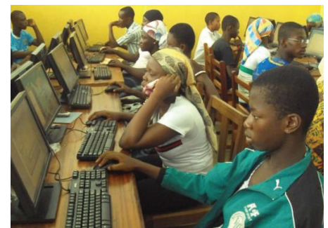
YOUNG LEADERS: ICT and leadership skills training in Northern Regional Library is helping build young people's technology, confidence and communication skills.

part time to raise money for further study. The library is now a recognized player in local development, hosting monthly public lectures and debates to deepen understanding about the value of ICT in addressing community needs in areas like health, the local economy, women's empowerment and education. http://bit.ly/1ztofYY