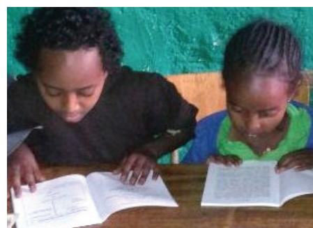
FAMILY LITERACY: Three rural libraries are creating e-books for pre-school children and organizing family literacy classes where parents can read with their children.

“ETHIOPIA LACKS MOTHER-TONGUE READING MATERIALS FOR CHILDREN, AND PARENTS DO NOT HAVE EXPERIENCE OF READING WITH THEIR CHILDREN. COMMUNITY LIBRARIES ARE VALUED BY THEIR COMMUNITIES. THEY PRESENT AN IDEAL OPPORTUNITY TO ADDRESS THESE ISSUES.”