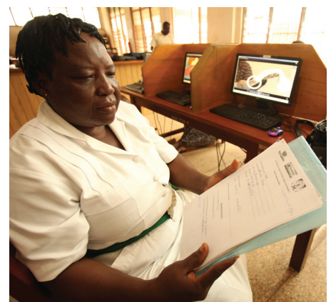
MATERNAL HEALTH: Health workers learn to use computers in Northern Regional Library's maternal health corner.