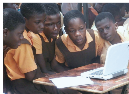
HANDS-ON: Children in rural schools that do not have computers or electricity get hands on experience through Volta Regional Library's mobile computer classes.

additional funding and technology support from the local technology agency, Ghana Investment Fund for Electronic Communication (GIFEC), which donated five desktop computers, additional solar panels, a canopy for outdoor lessons, desks and chairs. It also attracted over US$5,000 from individual donors through the online funding platform, GlobalGiving. http://bit.ly/1iZYE4E