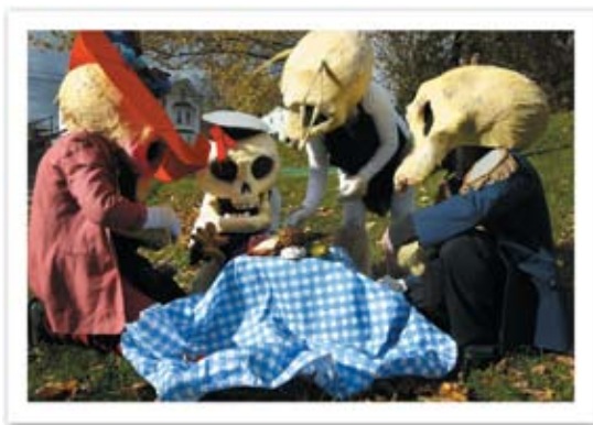
El Dia de los Muertos (the Day of the Dead) Celebration at Newburgh Free Library.