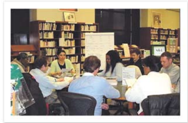
A Spanish conversation group meets at the Brooklyn Public Library.

■ Change doesn’t happen in a day. It can take a decade or more, and that’s okay.