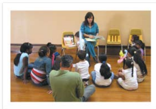
Spanish Storytime at the Utica Public Library.

Currently, the system’s member libraries and the agencies that provide direct service to the Spanish-speaking population reach out to the churches and send introductory letters to Spanish-speaking residents in the community. Reports noted that the letters helped to build trust. During the first workshop offered by the Pioneer Library System, at the Geneva Public Library, a panel of community leaders shared stories of immigration round-ups that have impacted the local farm economy and the isolation that occurs due to language barriers. The panel introduced Latin American foods that line shelves of area stores and commented on the difficulties some Spanish-speaking teens have in communicating with their peers. The persistence of one farmer who pursued legal aid for workers and the ensuing drama with immigration authorities suggest the potential positive impact of the library system’s outreach work in a complicated community situation. Facilitating communication among the community groups, agencies, and the legal system is critical.