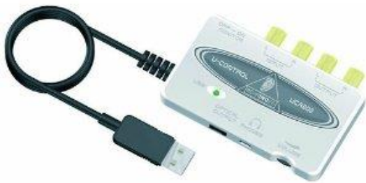
Behringer UCA202 Audio Interface $29.99 – 44.99