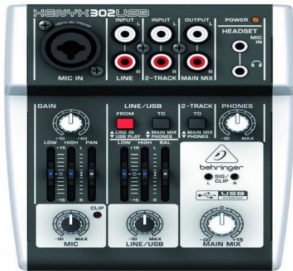
Behringer 302USB Premium 5-Input Mixer with XENYX Mic Preamp and USB/Audio Interface $39.99 – 49.99