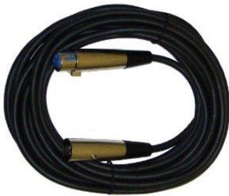
CBI MLC20 Low Z XLR Microphone Cable, 20 Foot $7.99