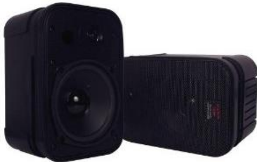
Pyramid 4080 High Performance 400 Watt book case Speaker System with Monitor Style Bass Reflex $39.99