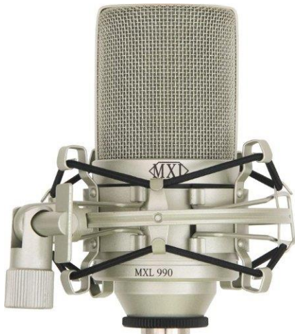
MXL 990 Condenser Microphone with Shockmount $97.95