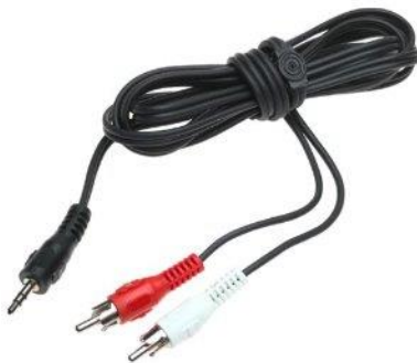
Belkin Audio Y Cable Splitter 1-Mini Plug, 2-RCA Plugs (6 feet) $2.15