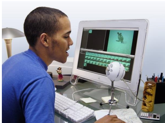
Blue Microphones Snowball USB Microphone $69.00

When Tameca Beckett wanted to start a digital media lab at her small Laurel (DE) Public Library ( read full story ), she knew there was no way she could muster the $30K+ that large urban libraries were spending on their labs. She decided to just get something started anyway. She purchased the following equipment, totaling about $400 at 2013 prices (2017 prices listed below).