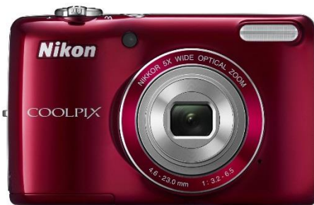
Nikon COOLPIX L26 16.1 MP Digital Camera with 5x Zoom NIKKOR Glass Lens and 3-inch LCD $44 – 100 (used); newer model: $139.99