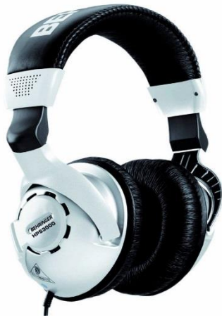
Behringer HPS3000 Studio Headphones $29.99